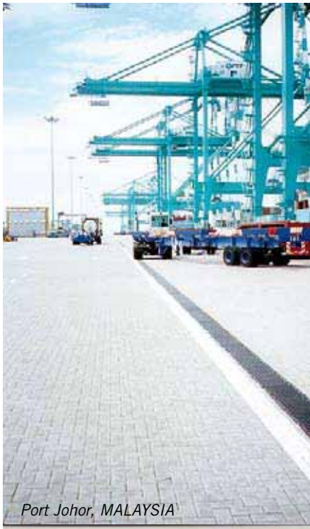
Port Johor, MALAYSIA

In 1999, the Malaysian Government embarked on the development of some new container docks at Tanjung Pelepas Port (Port Johor), located at the southern tip of Malaysia. This was an initiative for a strategically positioned port location to actively compete with other established south-east Asian ports, particularly Singapore and Hong Kong.