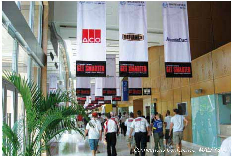
Connections Conference, MALAYSIA

With advances in distribution techniques, ACO now has the capability to deliver goods to stores or construction sites, regardless of the size of the consignment anywhere within Australia. The company has enjoyed a successful association with Lawrence and Hanson and Auslec stores for over ten years. Its attendance at the Connections Conference marks the start of an enduring reciprocal relationship for all parties.