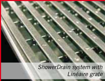
ShowerDrain system with Linéaire grate

Wet areas provide one of the most visible environments for drainage systems, requiring designers to select quality products for optimum performance, aesthetics and safety.