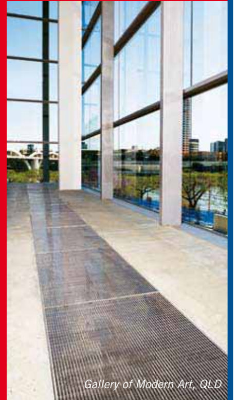
Gallery of Modern Art, QLD

Manufactured from stainless steel, and in widths up to 700mm, more than 500 lineal metres of grate now complements the overall industrial aesthetic of the gallery space.