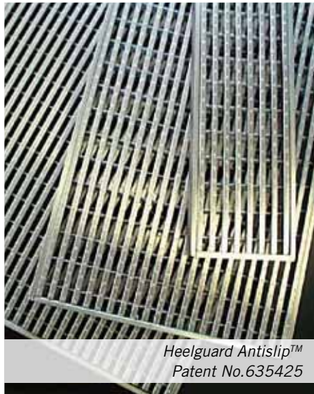
Heelguard Antislip™ Patent No.635425