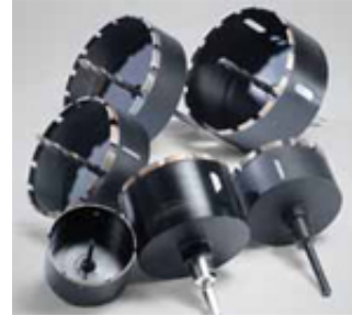
Range of sintered diamond holesaws for polymer concrete pits.