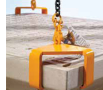
NATA certified pit lifters for Type 8 & 99 polymer concrete pits.