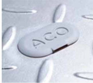
Universal plug allows lids to meet IP rating IP4X (AS 60529).

Polymer concrete pits and plastic pits may require different accessories. The table below will help guide your selection. If in doubt, contact ACO .