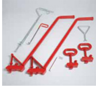
Range of lid & access cover lifters.