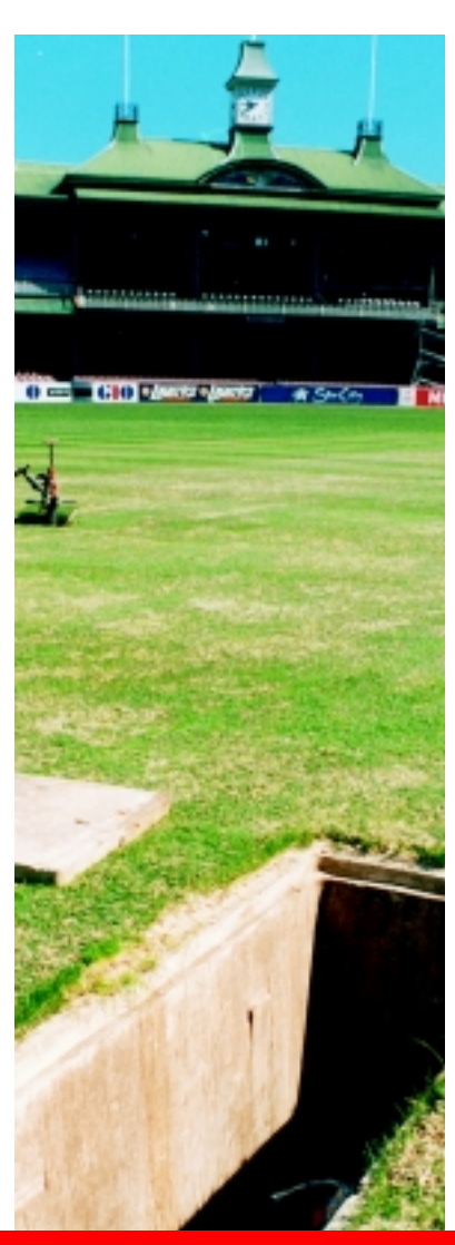
High Profile Applications

Sport System 2000 Sport System 4000 K Grated Trench Drain System K Grated Trench Drain System K Grated Trench Drain System Sport System 4000 K Grated Trench Drain System Stainless Steel Grating Sport System 4000 Sport System 4000 Cablemate Electrical Pits Grated Polymer Drainage Pits